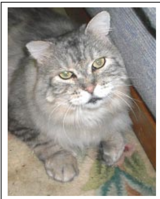
Phantom (see Living Proof on Page 2)

You can be part of our continued growth--help us GET THEM FIXED IN 2006 by making a donation today!