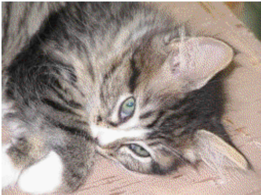
Ping, the little girl kitten from Camp Boondoggle fixed July 11th at CPC.

Countryside Vet Clinic--5 males; 1 female ~1 male; 1 female from Corvallis. ~2 males rescued from a man about to throw them in the river, by a low income Philomath woman ~1 feral male, trapped near Camp Boondoggle and may be one of the Boondoggle cats ~1 tame male from Boondoggle, the Albany homeless camp. Quite funny because when I crawled over the trains to go down into the camps to get him, I saw a cop van and news van, but nobody around them. I went on in and got the male and when I came out of the camps with him, the vans were gone. That night, I watched the ongoing news reports on Camp Boondoggle's eviction of its residents and they said all that was left of the camps was rubble and a few stray cats. Featured as "the stray cat" was this male. They must have filmed him, went on up the trails and I was right behind them, scooped him up. Funny in a way, but they could have saved him. He was no "stray". He was a crying desperate abandoned kitty trying to live in the rubble of his former home that the city of Albany bulldozed. Also today, at Companion Pet Clinic, three female kittens. One is another Camp Boondoggle cat.