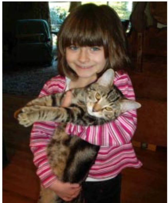
Just one of the many beloved kitties "fixed" through POPPA as part of this year's Tom & Mom Cat Special.