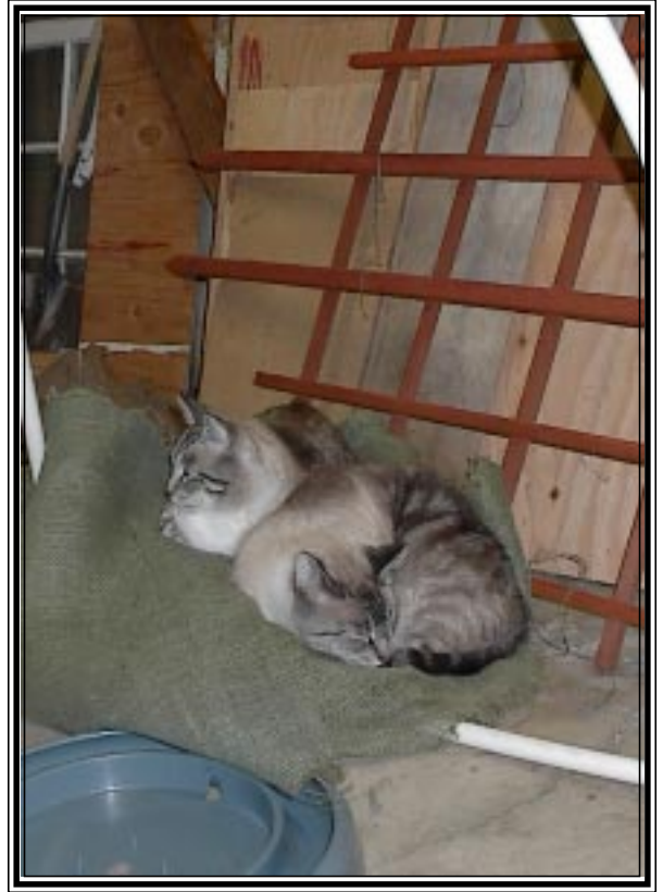
Newman & Lynx--a pair of POPPA recipients.

More info at 503-224-5718 or online via www.hardyplantsociety.org